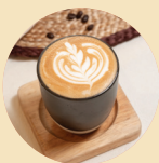
CAPPUCCINO 80 HOT OR ICED