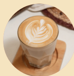
FLAT WHITE 80 HOT OR ICED