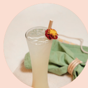
ELDER FLOWER LEMONADE 150