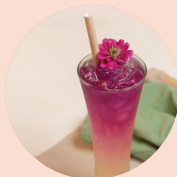
PURPLE LEMONADE 150