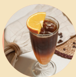
ICED ORANGE AMERICANO COFFEE, ORANGE, JUICE 105