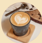
LATTE 85 HOT OR ICED