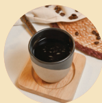
AMERICANO 80 HOT OR ICED