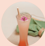
ROSE LEMONADE 150