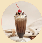
MOCHA FRAPPE ICED, COFFEE, MILK, CHOCOLATE SYRUP, VANILLA ICE CREAM, WHIPPED CREAM 130