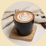
MOCHA HOT OR ICED, COFFEE, MILK, CHOCOLATE SYRUP, WHIPPED CREAM 110