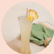
PINEAPPLE LEMONADE 150