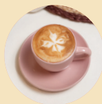
MACCHIATO 80 HOT OR ICED