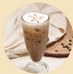
BROWN SUGAR OATMILK LATTE HOT OR ICED COFFEE, OAT MILK, BROWN SUGAR SYRUP, SPICES 110