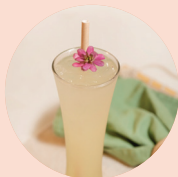
LYCHEE LEMONADE 150