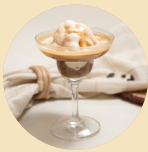
AFFOGATO COFFEE, ICE CREAM, CARAMEL SYRUP 110