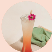
PINK GUAVA LEMONADE 150