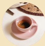
ESPRESSO 75 HOT + ADD SHOT 45