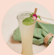
MINT LEMONADE 150