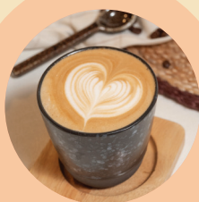
COCONUT LATTE HOT OR ICED, COFFEE, MILK, COCONUT SYRUP 110