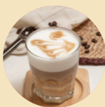
CARAMEL MACCHIATO HOT OR ICED, COFFEE, MILK, CARAMEL SYRUP, WHIPPED CREAM 120