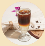
ICED COCONUT AMERICANO COFFEE, COCONUT 105