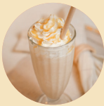
CARAMEL FRAPPUCINO ICED, COFFEE, ICE CREAM, CARAMEL SYRUP, WHIPPED CREAM 120